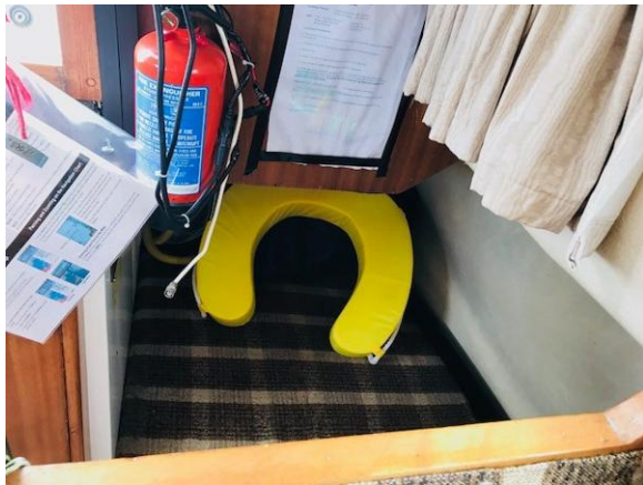
Aft quarter berth