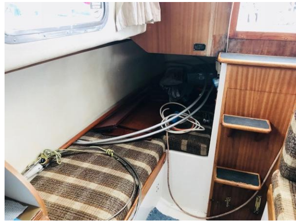
Aft quarter berth